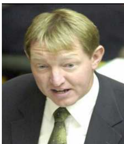
National's Nick Smith

If you want it 'fixed', these are the three you now need to persuade: The Environmentalist, The Lawyer & The Politician